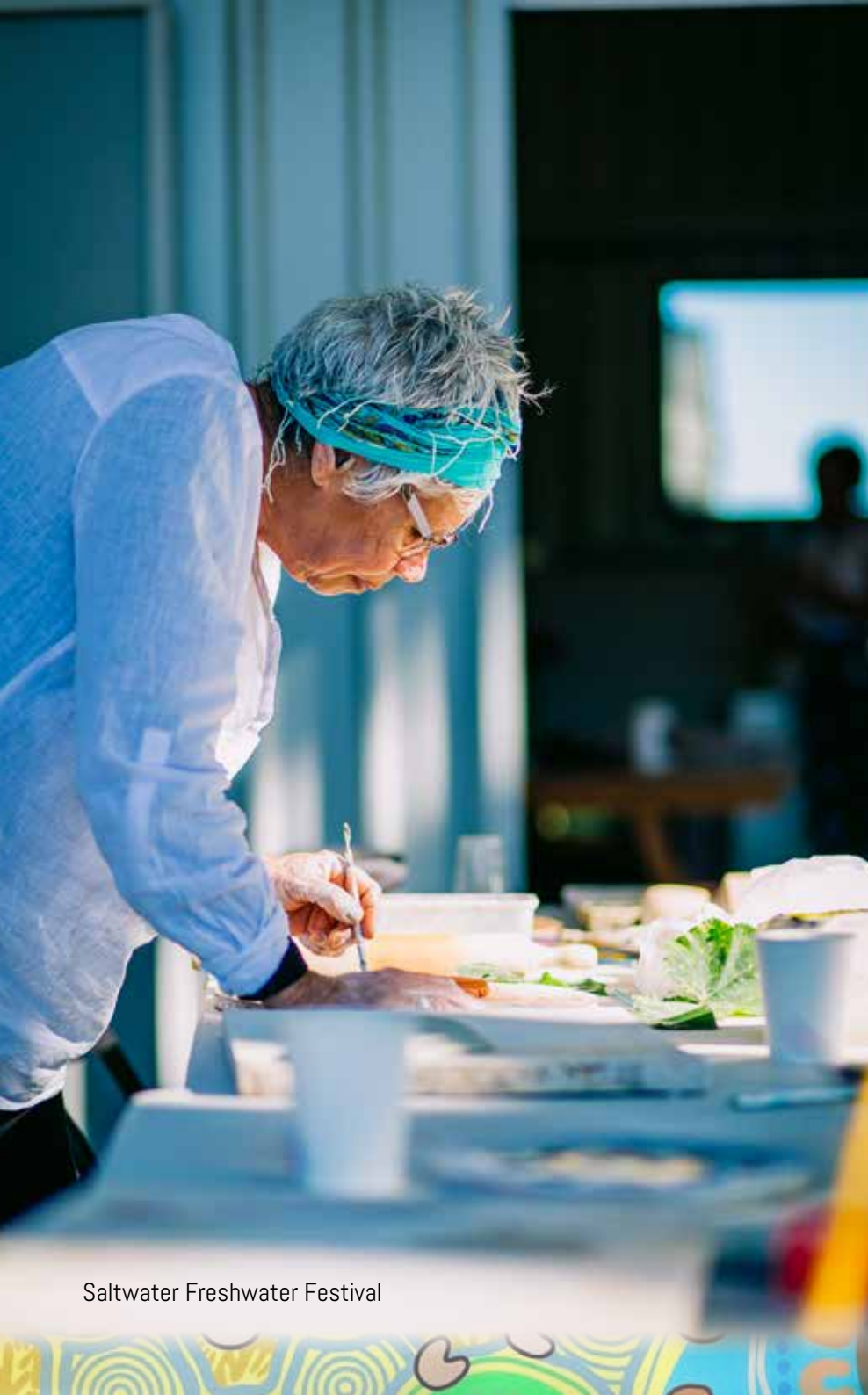
Saltwater Freshwater Festival