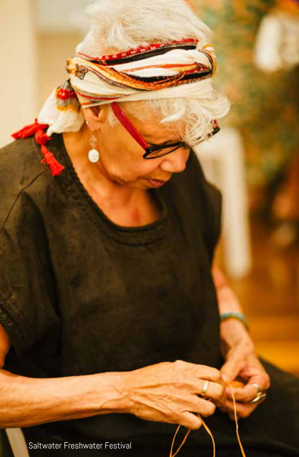
Saltwater Freshwater Festival