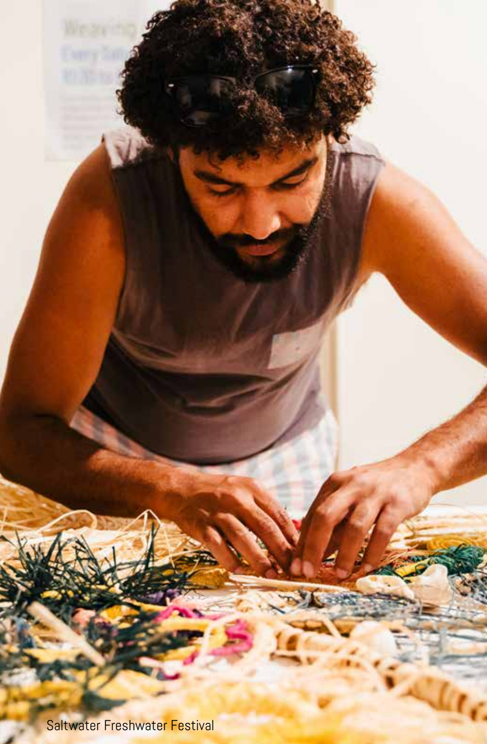
Saltwater Freshwater Festival