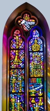
Stained Glass Window