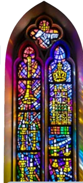
Stained Glass Window